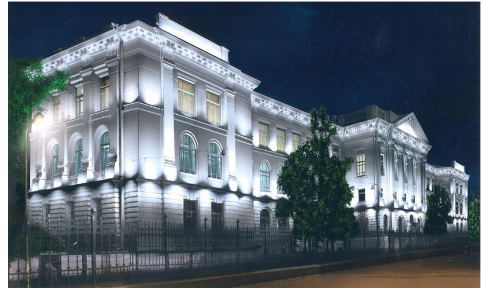
The buildings of Polytech university