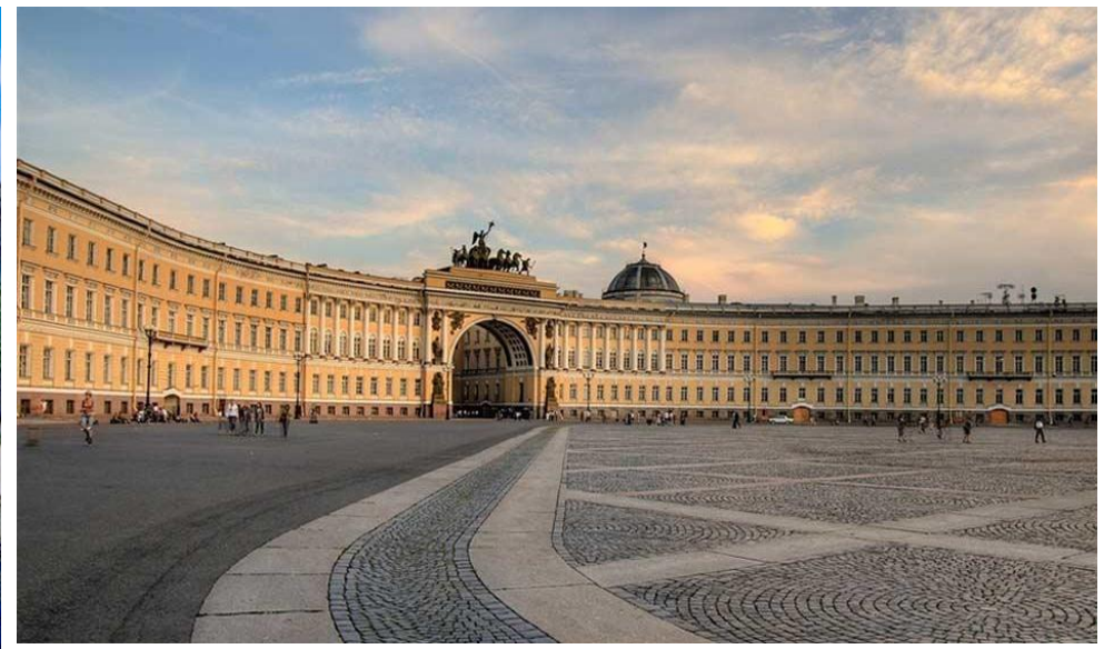
The General Headquarter building