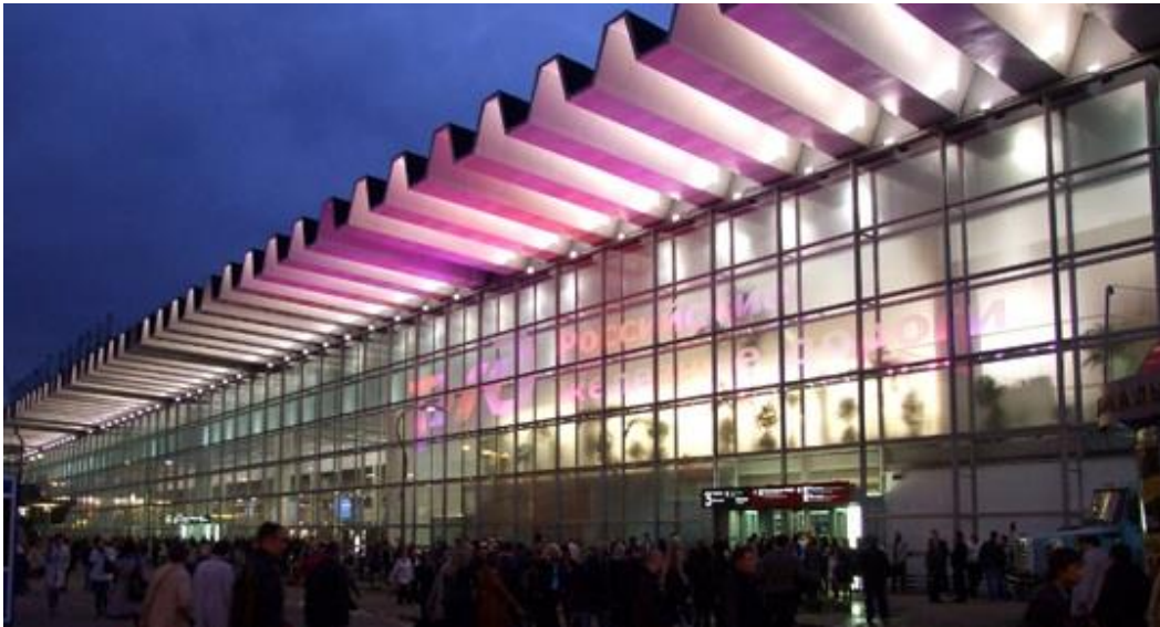
Moscow, Kursk railway station